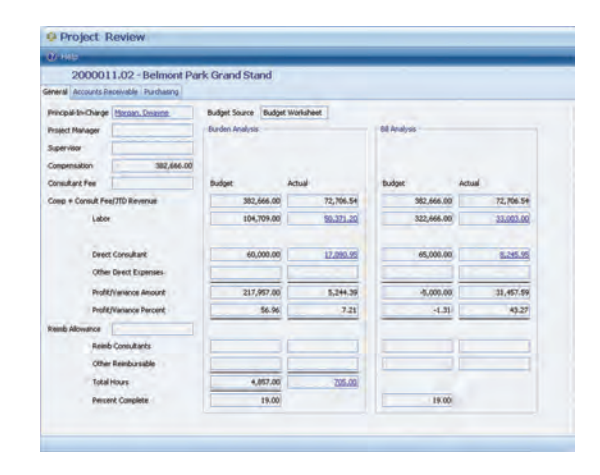
Figure 3: Vision provides complete detail on project costs to enhance internal control and provide a strong audit trail.

Anytime, anywhere access and zero-client install ensure that any user with Internet Explorer can access the system from—you guessed it—anywhere, at anytime. This allows your staff to access their information whenever they need it, without having to be chained to their personal desktop. Besides total access from virtually any location, Vision only requires a web browser for implementation—no plug-ins or applets needed. Vision's technological capabilities support hundreds of concurrent users, yet can be readily scaled down to meet the requirements and resources of any sized organization.