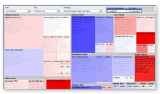
Figure 2: Deltek Vision Visualization provides a snapshot of your firm's performance.

The Deltek Vision analysis cubes use Microsoft SQL Server Analysis Services and Microsoft